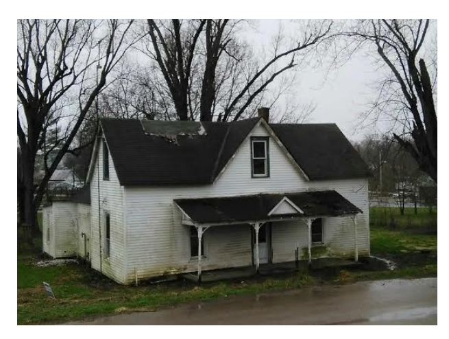
The former boarding house can be found on Spencer Pike road.